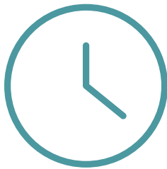
Family Interaction Specialist Training August 2023

The program infuses principles from the Nurturing Parenting Program into service delivery to build positive parenting skills and improve connection.