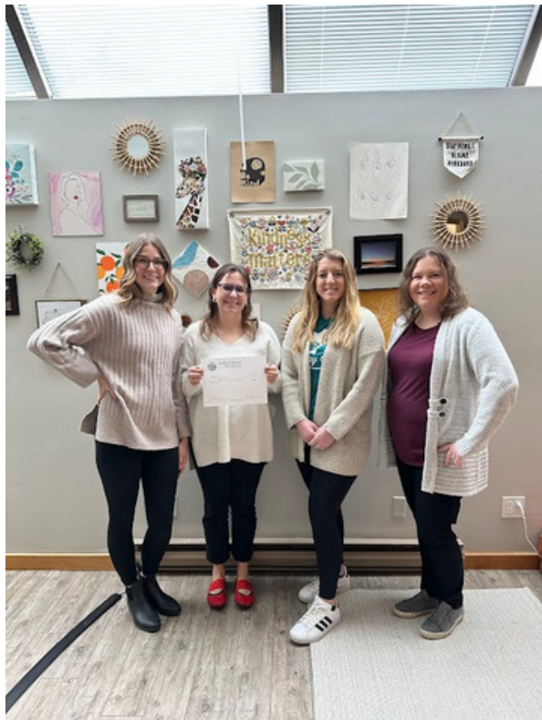
Oasis becomes certified Mental Health Clinic September 2023

Whether clients are served individually or in a group setting, treatment goals are similar. The program tracks improvement in proactive behaviors and self-esteem, as well as reduction in self-blame and trauma symptoms. Parents and caregivers have also reported increased knowledge on the impact of sexual abuse, and receive support on healthy parenting practices.